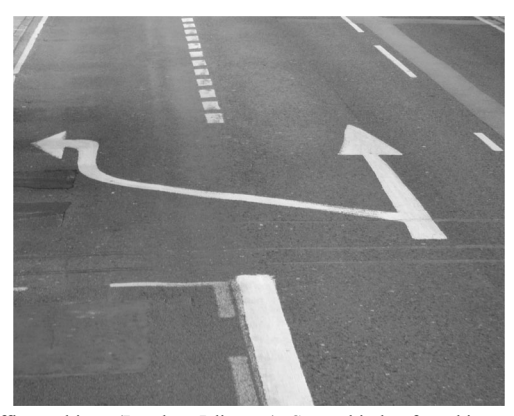
Fig. 4 Urban road traffic markings (London, Islington). Seven kinds of markings, some qualifying others.

It seems that the two accounts meet, yet, coming from different directions, the linguistic begins with the sign into which it seeks to incorporate the place,