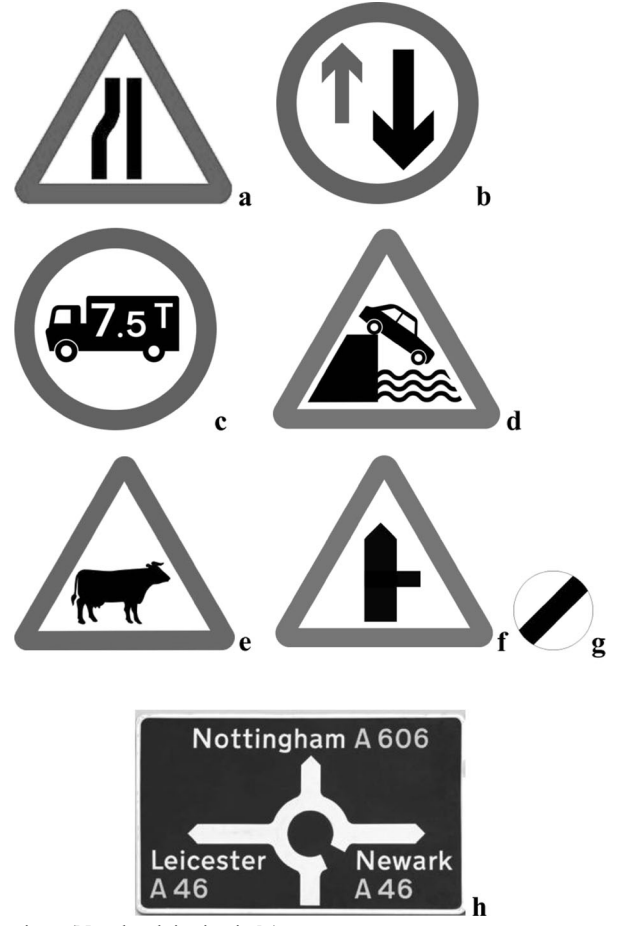
Fig. 3 UK traffic signs. (Note break in ring in h.)

not be visual, and we should in general beware a tendency to confuse sense access to cognition with cognition itself. <sup>9</sup> This discussion introduces the visual only when it becomes essential to user-descriptions, as with road signs.